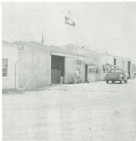
Above is the new resident engineer's office, job superintendent's office and maintenance area building at the Ouachita County area headquarters.