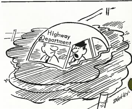
"This must be the place."